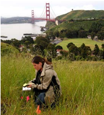
Gathering butterfly data near Fort Baker.

members of the grassland ecosystem, like birds, mammals and wildflowers as well. Restoring grasslands also reduces wildfire fuel buildup and conserves an important source for clean air and carbon sequestration.