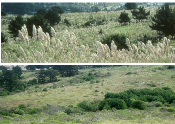
Top to bottom: For years Milagra Ridge was covered in invasive Pampas grass; Now that the Pampas grass has been removed, there is much more suitable mission blue habitat.