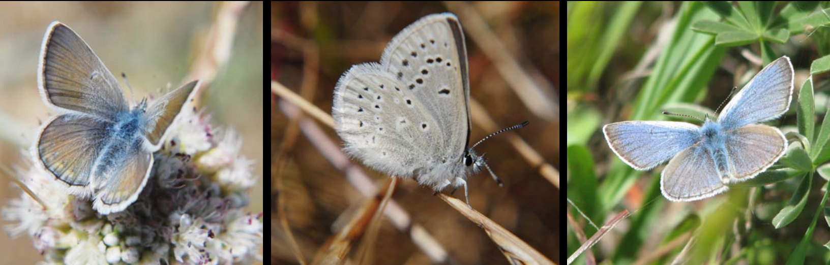
Left to right: Female mission blue butterfly, underside of a mission blue, and male mission blue butterfly