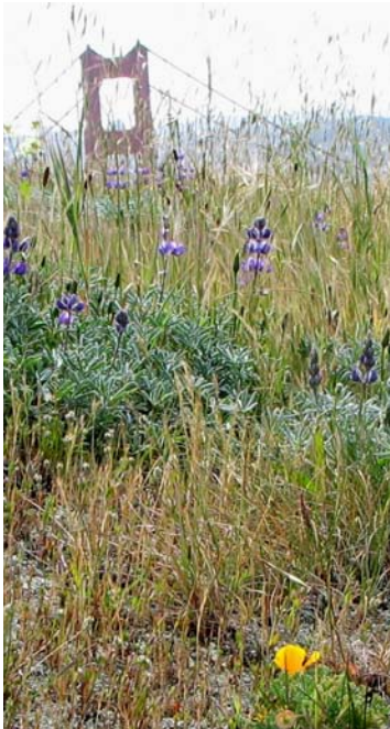
Mission blues' coastal grassland habitat with lots of lupines.

Favorite Foods Picky mission blue caterpillars eat only parts of lupine leaves, but adults have more varied tastes. Many favorite nectar flowers are members of the sunflower family.