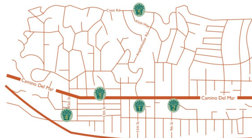
1: Free Parking Del Mar Civic Center - 1050 Camino Del Mar (Entry on 10th & 11th St just west of Camino Del Mar)

The Del Mar Garden Club (DMGC) will host its first-ever Del Mar Garden Club Community Gardens Day on May 9, 2026. From 10am to 1pm, Del Mar Garden Club member docents will be stationed within each garden to share the history, explain the unique features and specimens, and answer questions. Activities will include a scavenger hunt, ladybug giveaway, and free plant cuttings. All ages are welcome.