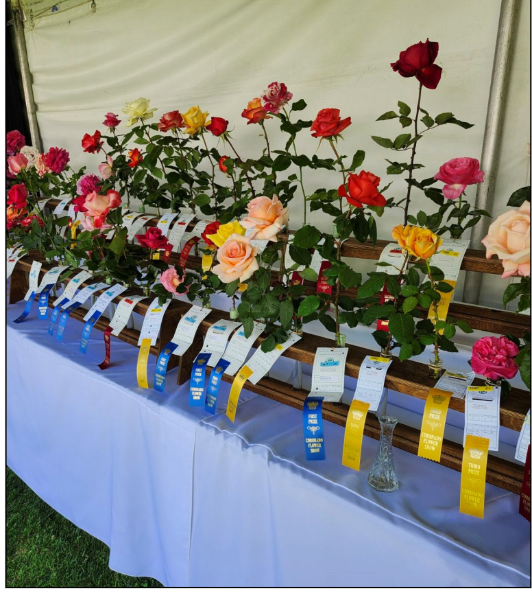
Roses, Roses, Roses...