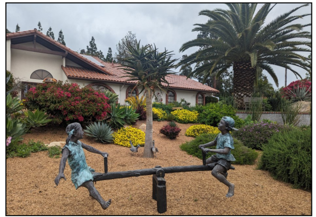
Wonderful gardens on the tour...