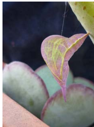
A sign of pure nature: a Chrysalis complete with thread. Taken in a new succulent planting.

Deadline for the next Palomar Pruner will be January 10 th , 2010. Please send your articles to the editor at jblankenship@san.rr.com