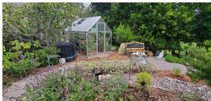
View of my Casa Verde , compost bin and herb garden from the kitchen window and a favorite garden spot for morning coffee.

I am having fun nurturing plants and harvesting veggies and not worrying about the critters.