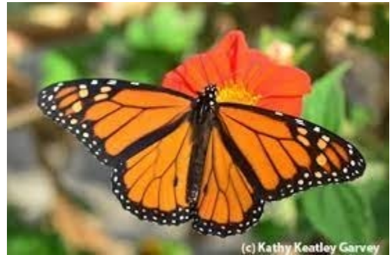
A male monarch nectaring on a Mexican sunflower, Tithonia rotundifolia , on a warm sunny day in Vacaville, Calif.

When is Western Monarch Day? Western Monarch Day is celebrated annually on February 5th. It is a day to celebrate the western Monarch butterfly that overwinters along the California coast. We have a lot to celebrate this winter with the population from the Thanksgiving Monarch Count conducted by the Xerces Society increase from 2,000 last year to 200,000 this year! Read more about this exciting news posted on the "Bug Squad Blog" from UC Davis ( https://ucanr.edu/blogs/blogcore/postdetail.cfm?postnum=51079 ):