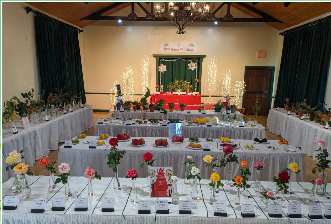
In November 2021 Poway Valley Garden Club held it's 42 nd Standard Flower Show, "Let's Celebrate the Holidays"

Would your Club like to share a special event, project, or other noteworthy item with the Palomar District members, then send it to palomardirector@gmail.com . Deadline: May 1, 2022