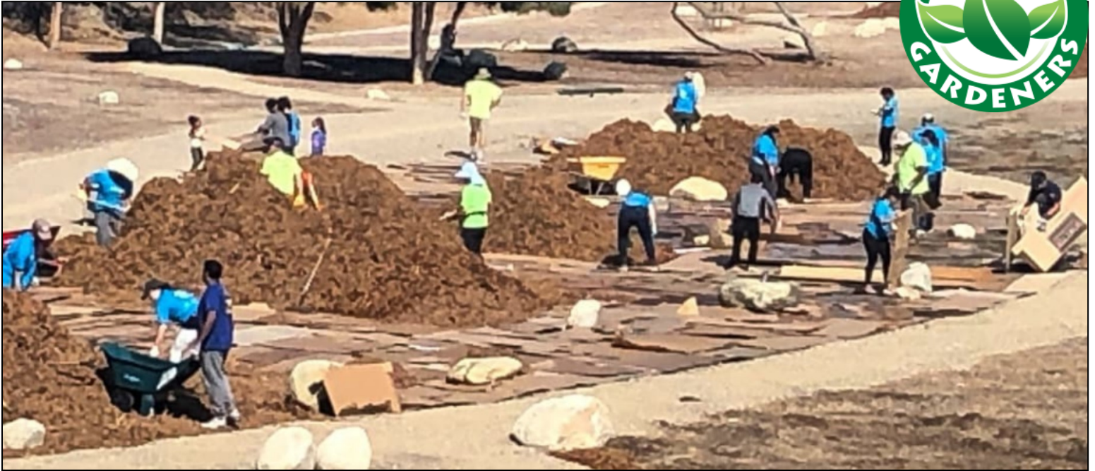
Paradise Hills Native Garden: Volunteers busy at work creating a pollinating garden. Next garden an ethnobotany garden.