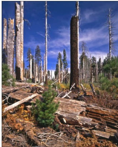
Destruction and new life after a California wildfire.

The Penny Pines Program plays a vital role both in renewing the national forests in California and in multiple-use management. Trees help the ground store precious water, protect against soil erosion and add to the scenic beauty of the national forests.