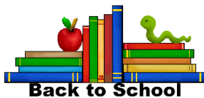
Back to School

All registration forms are on the CGCI website Calendar page californiagardenclubs.com/calendar