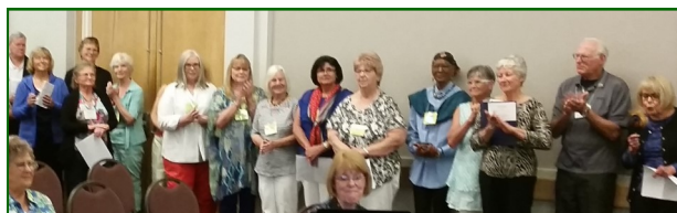
A few of the DDs ready to report!