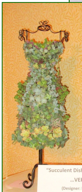
"People's Choice" winner at Placement Show