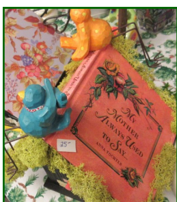
Interesting things to buy