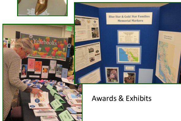
Awards & Exhibits