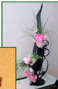
Entries in the Placement Show