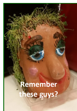
Remember these guys?