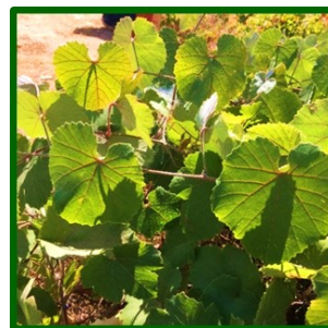
Vitis californica /California Wild Grape (Photo taken at Hughson Arboretum and Gardens, Hughson, CA)