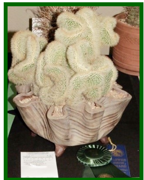
Award of Horticulture Excellence Trichocereus carmouquensis 'crestata'