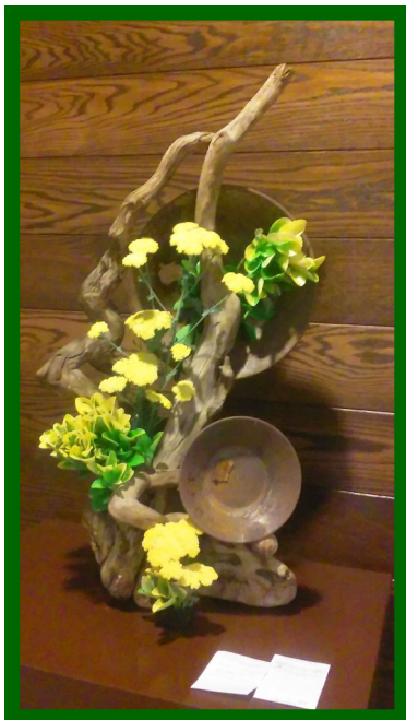
Award of Design Excellence