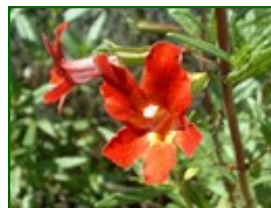
Red Monkey Flower