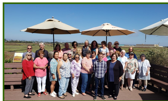
Participants at the Environmental School

The one and one-half acre San Bruno Mountain Botanical Garden , located within the San Bruno Mountain State & County Park in San Mateo County, is the beneficiary of this term's President's Project. The goal is to create a new garden that fulfills the original goal of representing the native plant communities, as well as create an outdoor classroom to learn about the unique flora of San Bruno Mountain with educational signage. The financial goal is to raise $20,000 for this two-year project that includes 1,000 plants representing 100 species native to San Bruno Mountain plus interpretive signage.