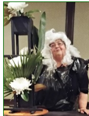
The "Design Diva" with one of her fabulous creations!