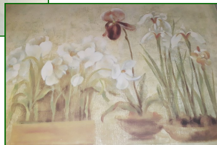
Iris painting - acrylic 36" w x 24" h (unframed) Value: $50