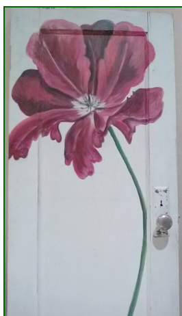
Painted flower door 24" w x 72" h: Value $50