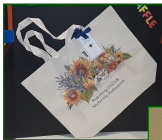
Mary Lake Thompson Limited Edition Tote Bag: Value $100

A special raffle to benefit the Endowment Funds is now underway. The drawing will be held during the 2019 CGCI Convention in Van Nuys. Tickets are $5.00 each or 5 for $20.00 and may be purchased from your District Director or at Con- vention. Items to be raffled are: