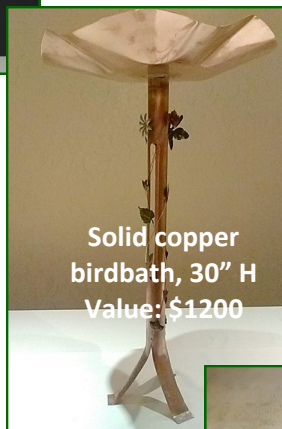
Solid copper birdbath, 30" H Value: $1200