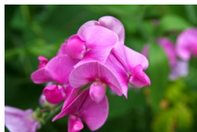
Answer: Sweet pea