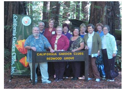
Dedication of President's Tree, 2011

Big Basin Redwoods State Park , California's first State Park, located in the Santa Cruz / San Mateo fire areas known as CZN Lightning Complex, is in danger! Cal Fire , has reported that we have sustained the loss of 84,640 acres and have 35% containment, as of Sunday, August 30, 2020. The devastation to our forests, homes, evacuation sites sheltering those in need, wildlife, pets, and damage to Big Basin Redwoods State Park and the outlying areas, has been an overwhelming experience for most of us living within this fire zone. Most of these areas have not been touched by fire in over 100 years. There are reports that some of the ancient Redwood Trees have survived. We're still hoping for the best possible outcome for the Park and the surrounding small towns, as well as Scotts Valley and Santa Cruz; however, some of the pictures tell a different story. Donations at this time, are needed! If you can, please donate to the CGCI Sempervirens Fund. You can contact me at: sempervirens@cagardenclubs.org or radicchi@aol.com or call 831-460-0545 or go to the CGCI website at http://californiagardenclubs.com/sempervirensfund . All donations are appreciated. Thank you!