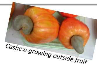
Cashew growing outside fruit

cannot reproduce itself. It can be propagated only by the hand of man.