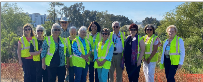
Conventioneers visit the President's Project

Thank you for making a positive difference in the lives of others, our community, and our state!