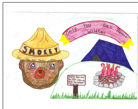
5th Grade Roseville Better Gardens GC