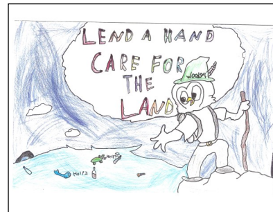
3rd Grade Tuolumne County GC