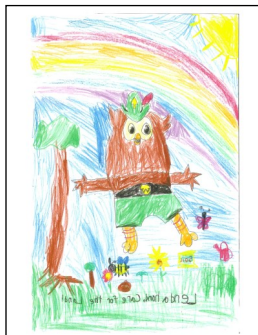
1st Grade Poway Valley GC