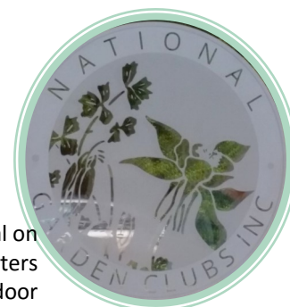
Engraved NGC seal on new headquarters door