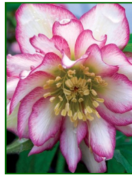
Helleborus Winter Jewels Rose Quartz : Sparkling white petals seem to be airbrushed with pleasing rose-pink around the edges. The large cup shaped flowers bloom on bushy mounds of deep green leathery leaves. A garden treasure. Easy to grow and low maintenance. Charming and welcome first flowering perennials of spring.