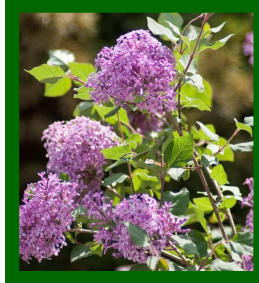
Bloomerang-reblooming Lilac Syringa: fragrant, small/compact, deer resistant.

National Arbor Day is celebrated the last Friday in April and in California on March 7th, in honor of Luther Burbank's birthday. Do you have plans for 2016? If there isn't room for a tree, how about one of these new shrubs: