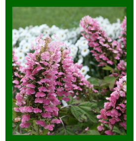
Gatsby Pink-Oakleaf hydrangea: showy blooms that quickly transform from pure white to a glorious pink