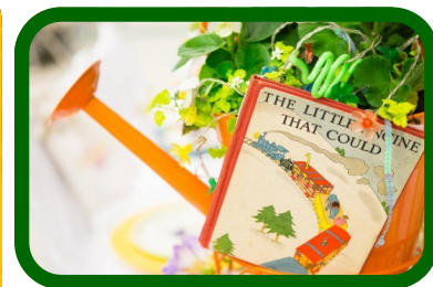
A sample of the table settings