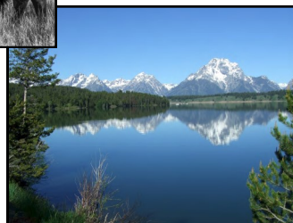
1st Place - Scene

To see all winning entries, go to gardenclub.org