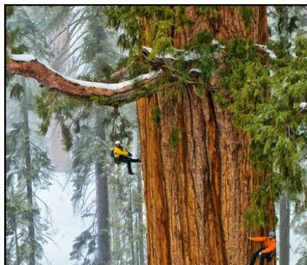
"Climbing" the tree

This giant sequoia located in the Giant Forest of Sequoia National Park, east of Visalia, is known as the President – named after President Warren G. Harding. It stands 247 feet tall with a trunk measuring 27 feet across and is estimated to have 2 billion leaves/needles. It is the third largest tree in the world, but at 3,200 years it is the oldest known living Sequoia. Due to its size it had never been photographed in its entirety until 2012 when a team of National Geographic photographers, working with a group of scientists, took thousands of photos as they climbed the tree using a system of pulleys and levers. They selected 126 of the photos and compiled them into a mosaic to produce the final incredible portrait.