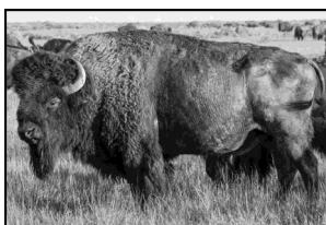
1st Place - Fauna