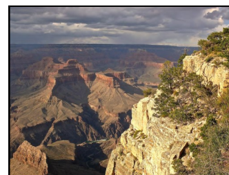
3rd Place - Mountains

Terry Sampson, Hesperia GC Yep...she's one of ours CONGRATULATIONS