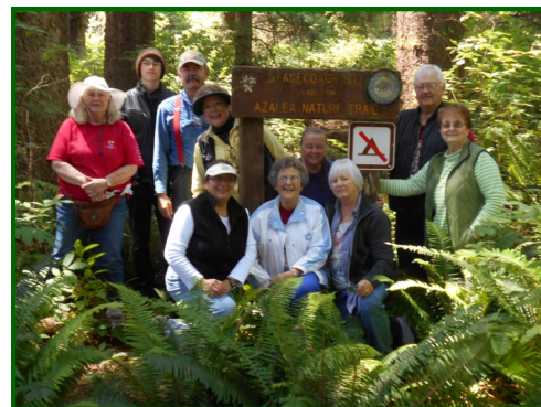
A few of the volunteers who helped with the first collection of cuttings and seeds.

The newest CGCI Project is to help provide funding to propagate 300 rare, native azaleas from cuttings and seeds and then replanted in the same area. The project goal is to raise $6,000 to cover the propagation expenses.