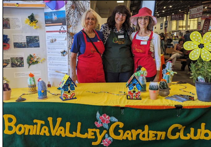
Bonita Valley Garden Club sharing their Club information and smiles