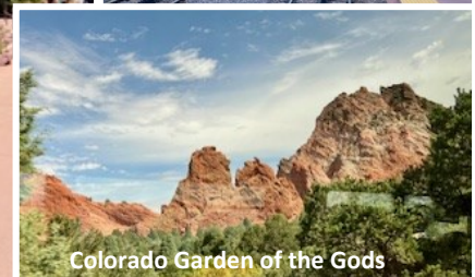
Colorado Garden of the Gods