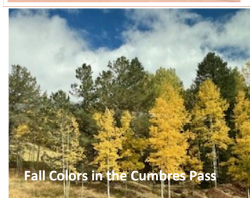
Fall Colors in the Cumbres Pass