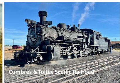
Cumbres & Toltec Scenic Railroad