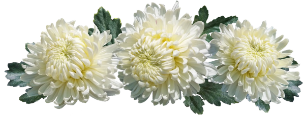
Chrysanthemum — flower of the month

9:30 a.m. Doors Open 10:00 a.m. Business Meeting 11:00 a.m. Program: Plant Sale