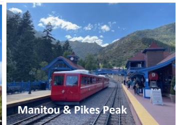
Manitou & Pikes Peak